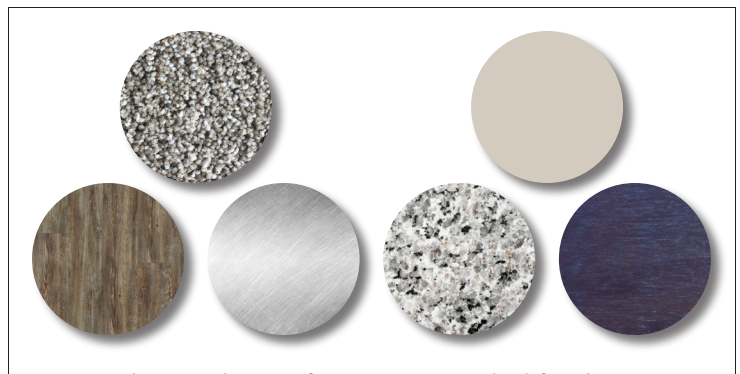
The Manhattan features upgraded finishes

The Manhattan luxury 1 & 2 bedroom apartments are the latest in apartment living and available exclusively at Brookridge Heights.